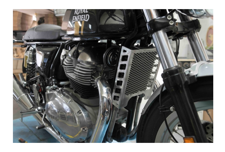
The end result should appear as in the photo Thank you for choosing one of our products.