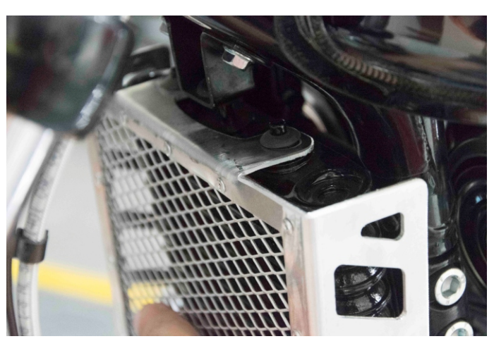
Place the rubbers that you will find in the installation package as shown in photo 3 and in the same way place the new radiator grill in its position.